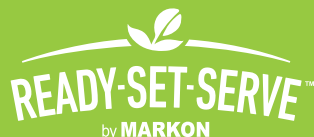
Table-ready fruits & vegetables. Backed by 5-Star.