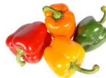
bell peppers green/red

Prices are fairly steady. Stocks are adequate in California and Mexico; demand has decreased slightly. RSS Avocado Chunks, Halves, Pico de Gallo Guacamole, and Pure Pulp are available.