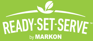
Table-ready fruits & vegetables. Backed by 5-Star.