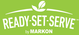
Table-ready fruits & vegetables. Backed by 5-Star.