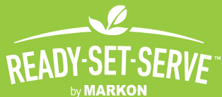
Table-ready fruits & vegetables. Backed by 5-Star.