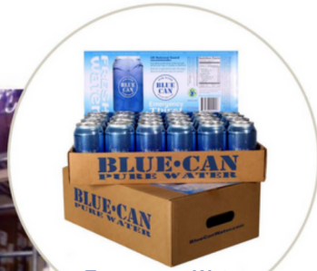
Emergency Water available