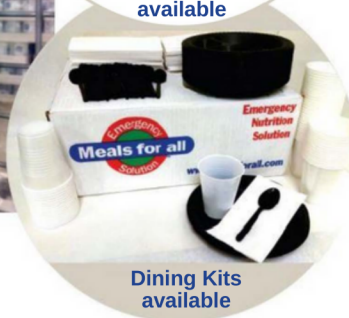
Dining Kits available

Meals for All are real foods that contain USDA inspected beef, chicken, and turkey with no soy substitutes and no preservatives. All the meals are fully cooked before dehydrating or freeze drying. Meals for All are packed to easily transport with the emergency victims, should an evacuation be necessary.