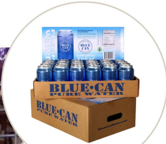
Emergency Water available