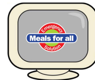
*Menu for Days 4-7 is available online @ www.mealsforall.com