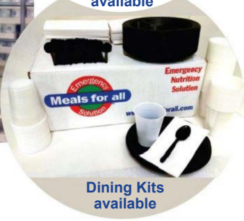
Dining Kits available

Meals for All are real foods that contain USDA inspected beef, chicken, and turkey with no soy substitutes and no preservatives. All the meals are fully cooked before dehydrating or freeze drying. Meals for All are packed to easily transport with the emergency victims, should an evacuation be necessary.